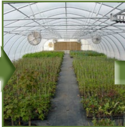
May 1999 - Root system begins in greenhouse