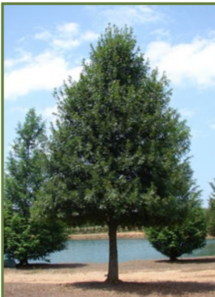
Esplanade® Nuttall Oak