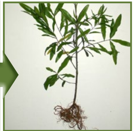
September 1999 - Own-root clonal stem cutting