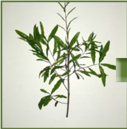
May 1999 - Stem cutting from sustainable tree